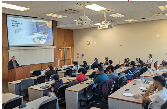
Students learn from professionals about computer science careers.