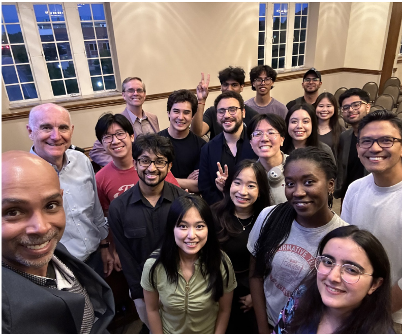
Members of sponsoring student organizations pose with distinguished alumni speakers and faculty.